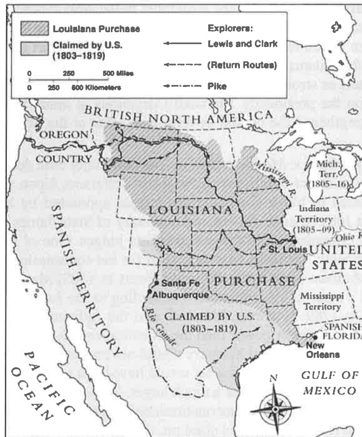
THE LOUISIANA PURCHASE, 1803

Consequences The Louisiana Purchase more than doubled the size of the United States, removed a European presence from the nation's borders, and extended the western frontier to lands beyond the Mississippi. Furthermore, the acquisition of millions of acres of land strengthened Jefferson's hopes that his country's future would be based on an agrarian society of independent farmers rather than Hamilton's vision of an urban and industrial society. In political terms, the Louisiana Purchase increased Jefferson's popularity and showed the Federalists to be a weak, sectional (New England-based) party that could do little more than complain about Democratic-Republican policies.